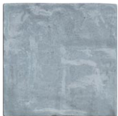
MK-169 Sky Matt 10x10cm