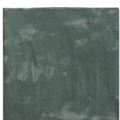
MK-104 Green Gloss 10x10cm