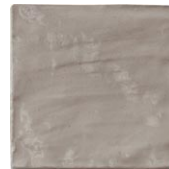
MK-172 Taupe Matt 10x10cm