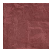
MK-113 Red Gloss 10x10cm