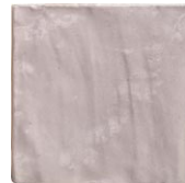
MK-110 Pink Gloss 10x10cm