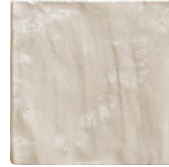
MK-116 Sand Gloss 10x10cm