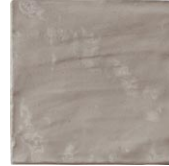
MK-122 Taupe Gloss 10x10cm