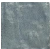
MK-101 Aqua Gloss 10x10cm