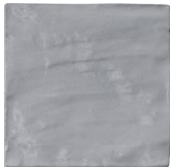
MK-107 Grey Gloss 10x10cm