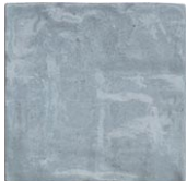
MK-119 Sky Gloss 10x10cm