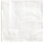
MK-125 White Gloss 10x10cm