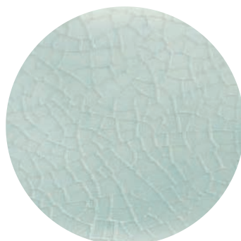
Surface Finish - Aqua