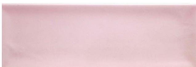
Pink Matt 10x30cm