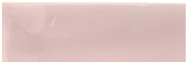
Pink Gloss 10x30cm