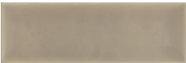
Brown Gloss 10x30cm