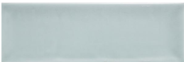
Duck Egg Matt 10x30cm