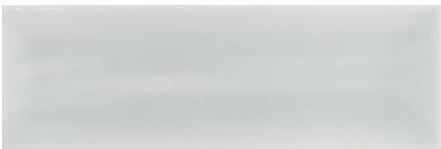
Ice Gloss 10x30cm