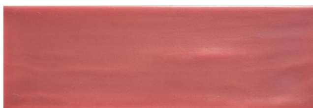
Burdos Matt 10x30cm