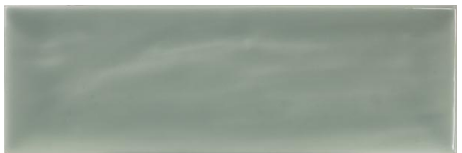
Green Gloss 10x30cm