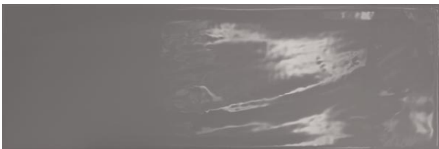
Marengo Gloss 10x30cm