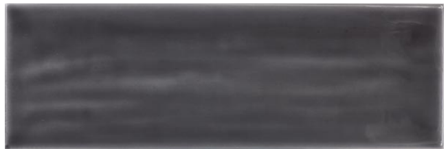
Black Gloss 10x30cm