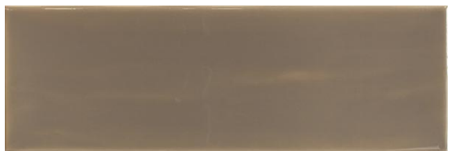
Dark Brown Gloss 10x30cm