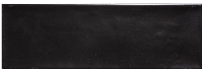
Black Matt 10x30cm