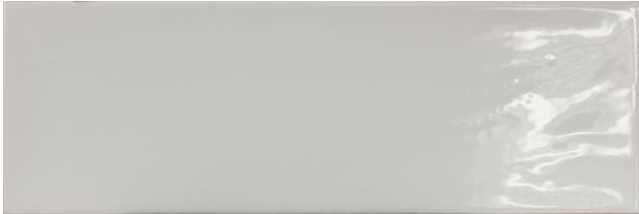
White Gloss 10x30cm