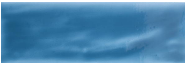
Blue Gloss 10x30cm