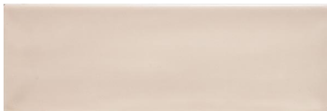
Cotto Matt 10x30cm