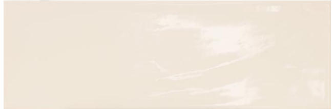
Cream Gloss 10x30cm