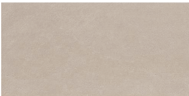
Tortora 30x60cm Rectified