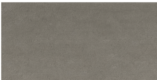
Plumb 30x60cm Rectified