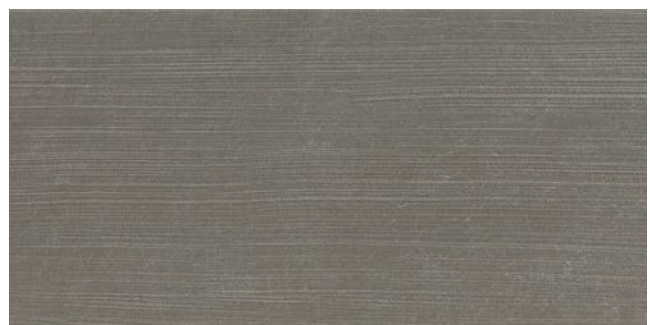
Plumb Resin 30x60cm Rectified