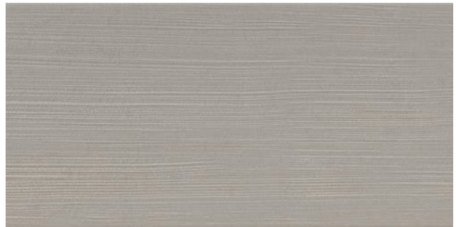
Concrete Resin 30x60cm Rectified