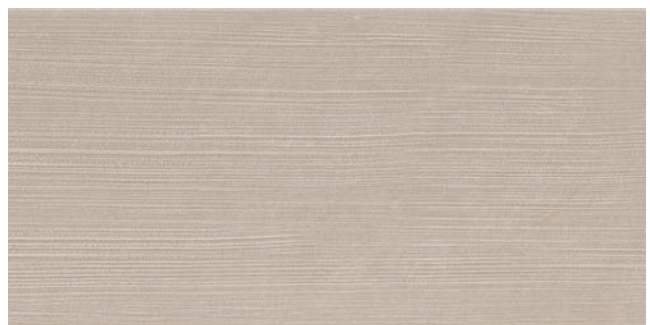
Tortora Resin 30x60cm Rectified