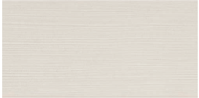
Snow Resin 30x60cm Rectified