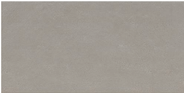
Concrete 30x60cm Rectified