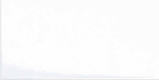
BW-3601 Brilliant White Gloss 30x60cm