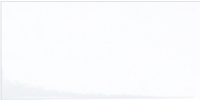
BW-3602 Brilliant White Gloss 29.8x59.8cm Rectified