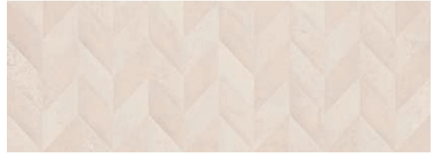
Neutro Decor 25x70cm