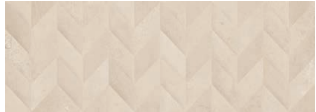
Arena Decor 25x70cm