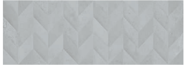
Perla Decor 25x70cm