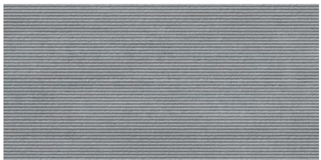
Gris Décor 45x90cm