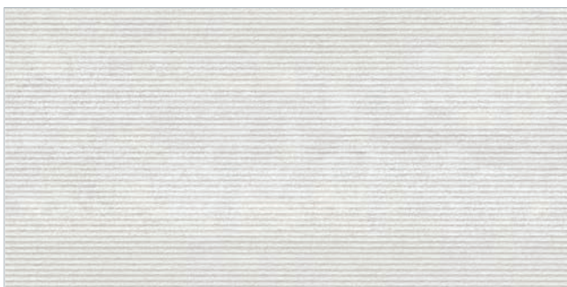
Blanco Décor 45x90cm