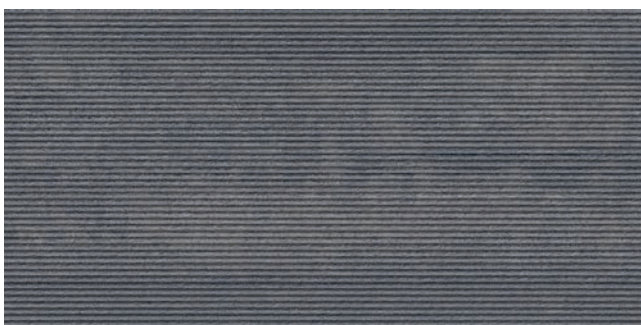
Marengo Décor 45x90cm