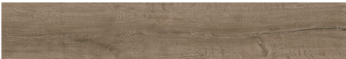
Teca 25x150cm Rectified