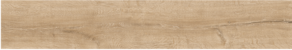
Oak 25x150cm Rectified