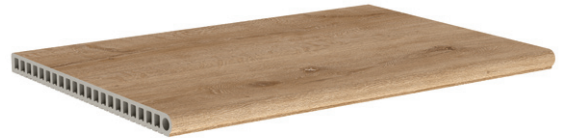
Pool Coping 45x75cm