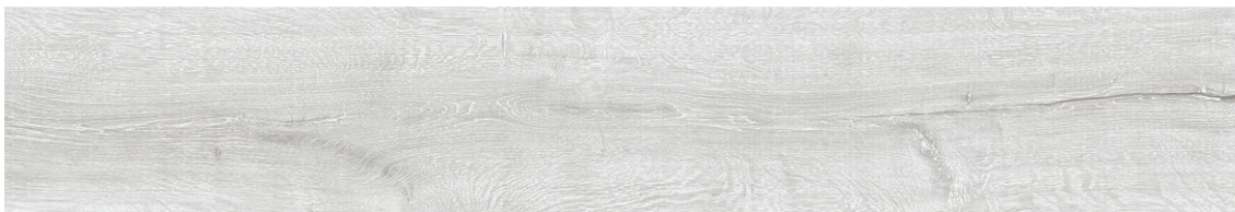
Natural 25x150cm Rectified