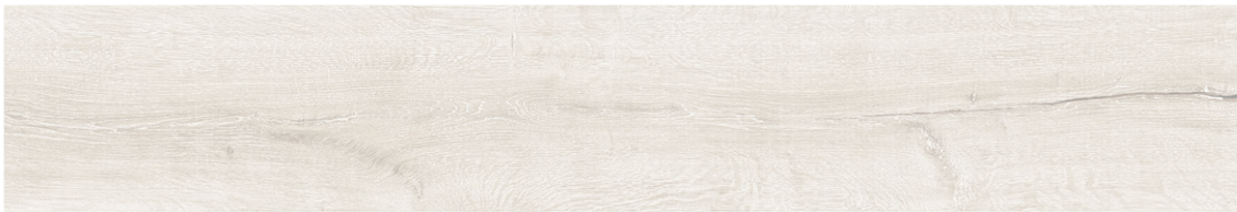
Maple 25x150cm Rectified