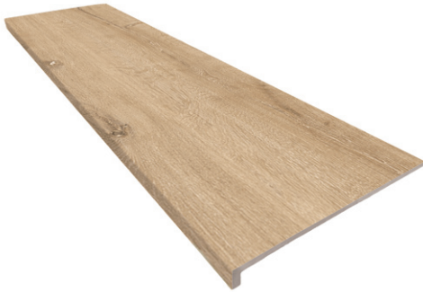
Square Step Edge 33x120cm